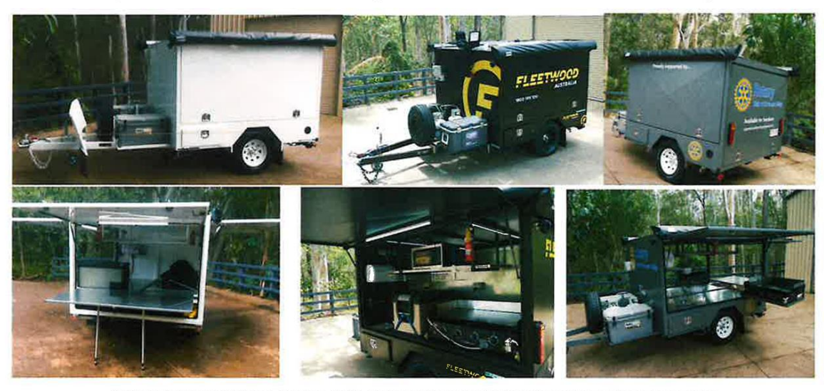
Wider Recessed Wheel Pantec BBQ Trailers we have built with varied options requested White – Rear Door & Prep Bench / Black – Cooking one side/work station other side / Grey – Swing out BBQ's