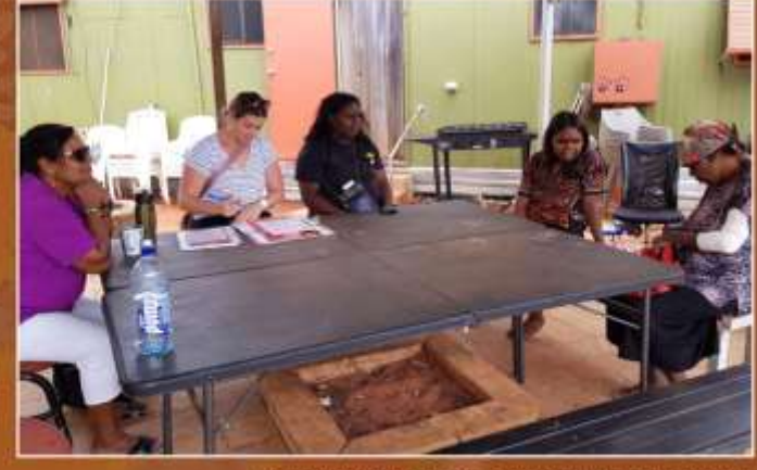
Voyages Information session with Participants

The different experiences will range from Housekeeping. Security. Landscaping/Gardening. Hotel Front of House. Food & Beverage, Kitchen Steward, and Retail with more planned. Voyages develop new ways to allow job seekers to experience and build skills to join the workforce.