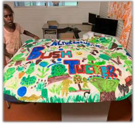
Bush Tucker Car bonnet ready for clear coat sealing.