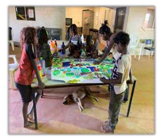
Bush Tucker Car Bonnet Painting