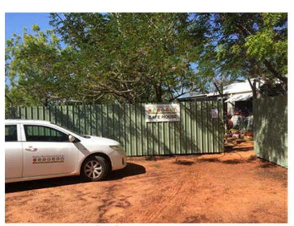
Before and After New Fence. Fence Completed on the 11/02/2020.