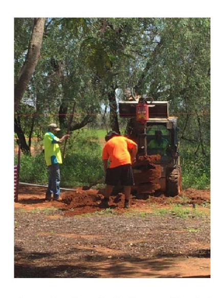
Contractor's from Harvey Development NT start work on the New Safe House Aluminium Fence. (03/02/2020)