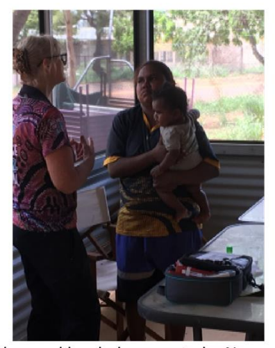
Mother and her baby seen to by Nurse.